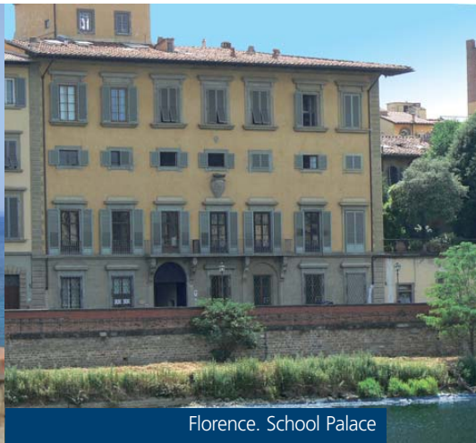
Florence. School Palace