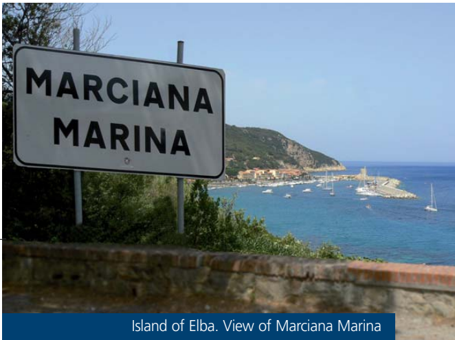
Island of Elba. View of Marciana Marina