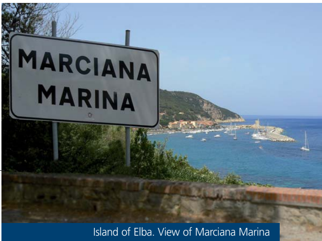
Island of Elba. View of Marciana Marina