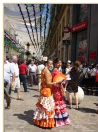
Malaga Fair in August