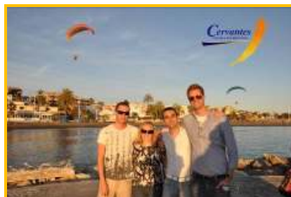
Pedregalejo Beach (School area, Malaga)