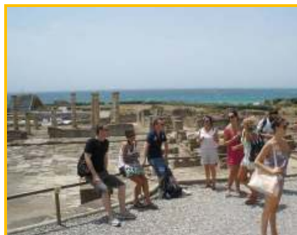
Baelo Claudia Roman Ruins