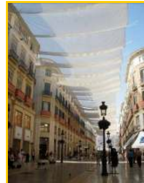
Malaga Main Street (Larios)