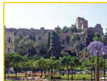
Malaga's Alcazaba Fortress