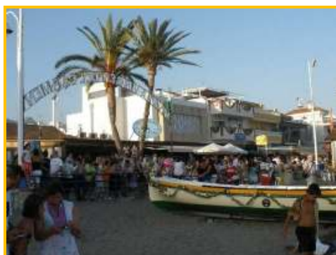
Virgen del Carmen Festivities