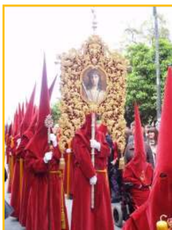
Holy Week (Easter)