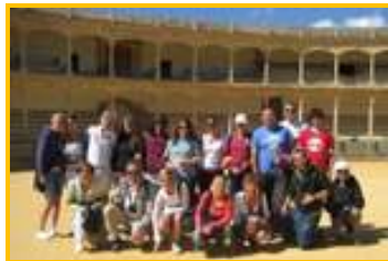
Ronda bull ring

The price of the excursions is around 50 Euros, depending on the destination.