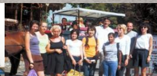
Guided visit to Montpellier