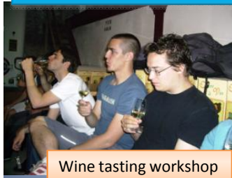
Wine tasting workshop