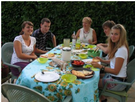
At family's home