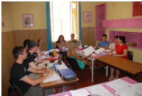
Comfortable and pleasant classrooms