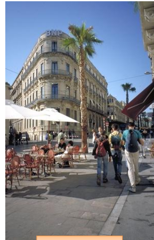
Ecole Klesses' building