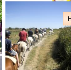
Horse riding in Camargue