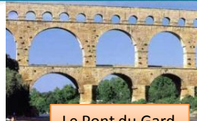
Le Pont du Gard