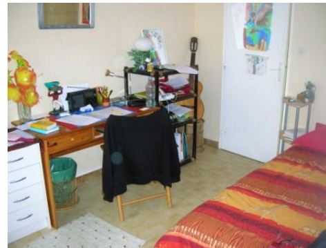
Furnished bed rooms