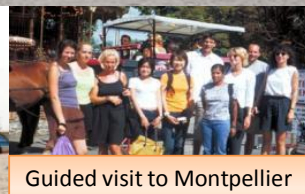
Guided visit to Montpellier