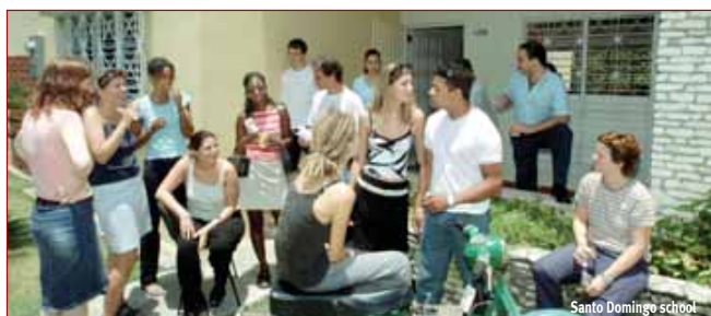
Santo Domingo school

Cabarete accommodation is available for Sosua students only. Sosua school apartment/studio: breakfast is served Monday through Saturday, except on National holidays. Double rooms are available on request and only for 2 students traveling together: 25% discount on the single room price.