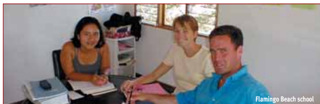
Flamingo Beach school