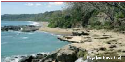
Playa Jaco (Costa Rica)