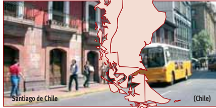
Santiago de Chile (Chile)