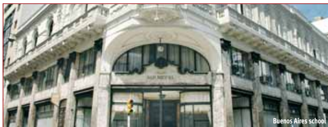
Buenos Aires school

*Please check http://www.enforex.com/holidays-latinamerica.html for updated holidays, as they may be subject to change.