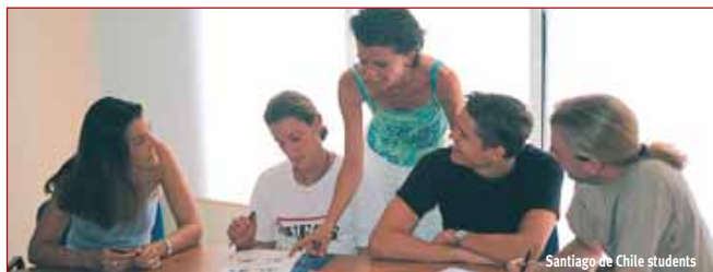
Santiago de Chile students