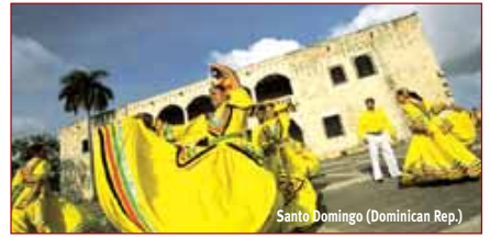
Santo Domingo (Dominican Rep.)