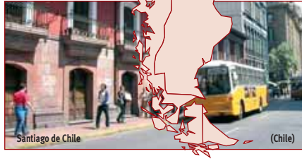
Santiago de Chile (Chile)