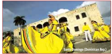
Santo Domingo (Dominican Rep.)