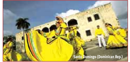
Santo Domingo (Dominican Rep.)