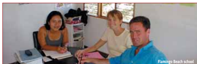
Flamingo Beach school