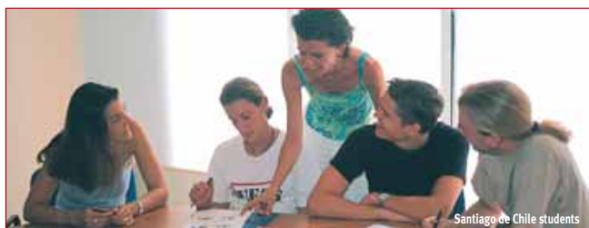
Santiago de Chile students