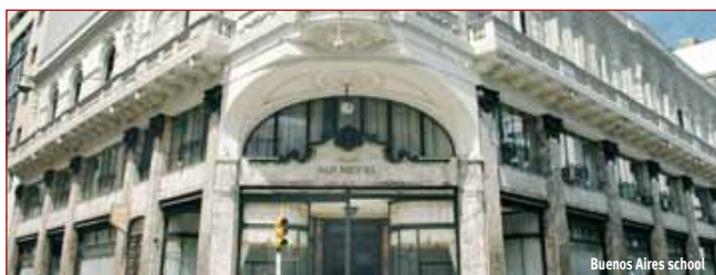
Buenos Aires school

*Please check http://www.enforex.com/holidays-latinamerica.html for updated holidays, as they may be subject to change.