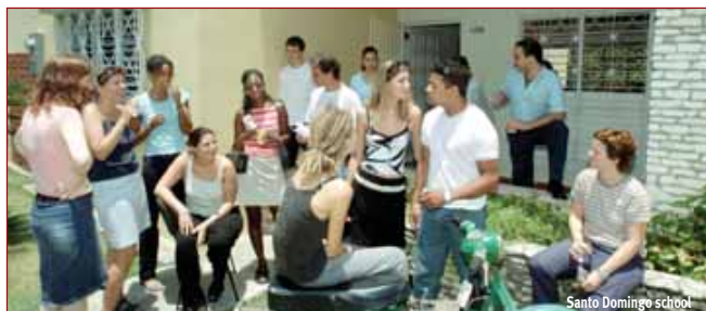
Santo Domingo school

Double rooms are available on request and only for 2 students traveling together: 25% discount on the single room price.