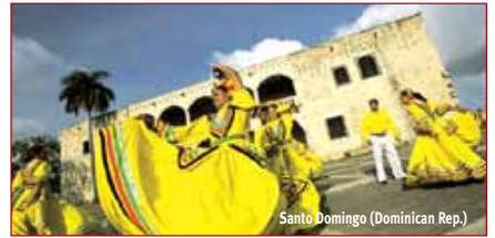
Santo Domingo (Dominican Rep.)