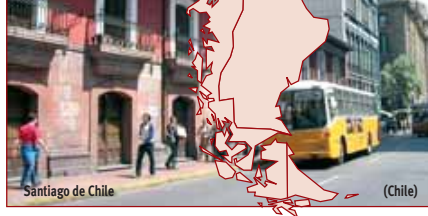
Santiago de Chile (Chile)