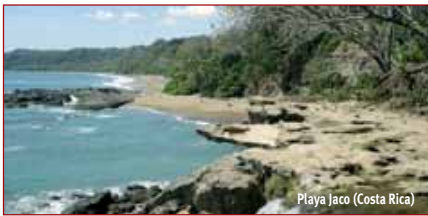
Playa Jaco (Costa Rica)