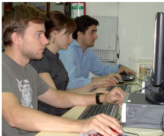
Free internet access and wireless "wi-fi" access in all Sampere Schools

We teach in very small groups of 6 students maximum per group (9 maximum in May, June and July).