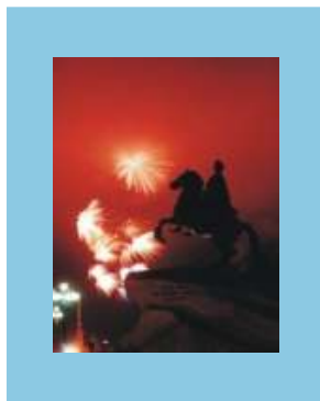
Peter the Great, Founder of St. Petersburg

“Liebe Extra-Class-Team, Vielen Dank fuer die wunderbare Zeit; ihr seit die beste Sprachschule die ich kenne! Alles Gute fuer die Zukunft!”