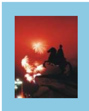
Peter the Great, Founder of St.Petersburg

“Liebe Extra-Class-Team, Vielen Dank fuer die wunderbare Zeit; ihr seit die beste Sprachschule die ich kenne! Alles Gute fuer die Zukunft!”