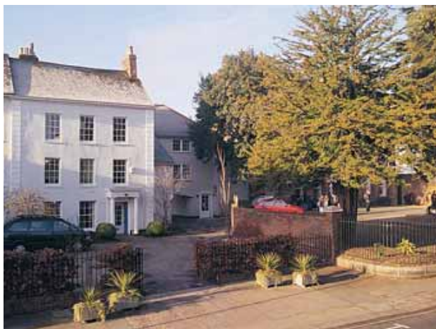
The Globe reception