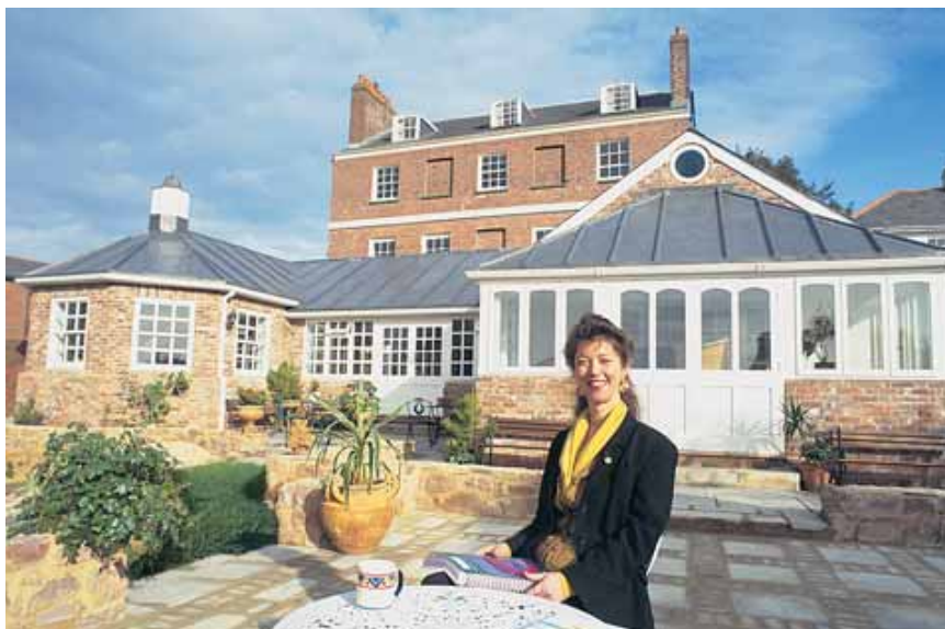
The Director outside the School's garden rooms

Exeter, the capital city of the county of Devon, is 2h15 from London and 20 minutes from the sea! It is very popular with British and foreign tourists, thanks to its rich mixture of culture, beauty, charm and proximity to some of the best beaches in Britain. Exeter combines the excitement of a large city with the friendliness of a close community and is surrounded by spectacular countryside. It is also one of Britain's safest cities, helping to make it the ideal location to combine learning a language with making new friends.