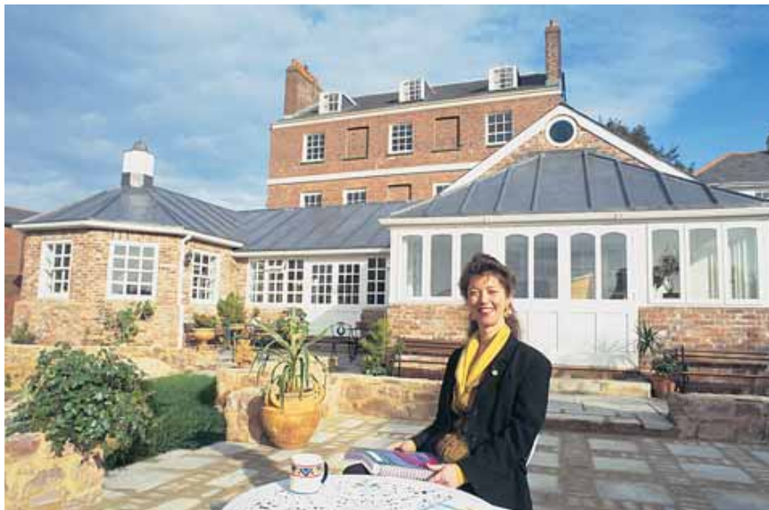
The Director outside the School's garden rooms

Exeter, the capital city of the county of Devon, is 2h15 from London and 20 minutes from the sea! It is very popular with British and foreign tourists, thanks to its rich mixture of culture, beauty, charm and proximity to some of the best beaches in Britain. Exeter combines the excitement of a large city with the friendliness of a close community and is surrounded by spectacular countryside. It is also one of Britain's safest cities, helping to make it the ideal location to combine learning a language with making new friends.