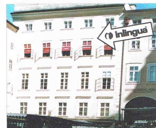
inlingua at Universitätsplatz 17