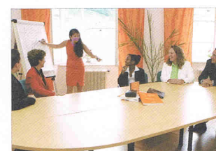
mini group courses