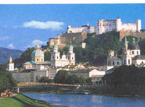
city of Salzburg

BANK: BA-CA, CODE: 12000 BIC/SWIFTCODE: BKAUATWW IBAN: AT14 1200 0263 1166 7700 KONTO NR: 263 1166 77 00