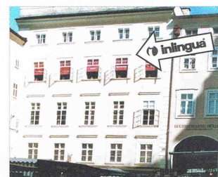
inlingua at Universitätsplatz 17