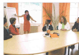
mini group courses