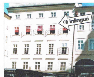
inlingua at Universitätsplatz 17