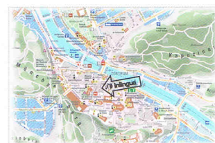
located in the historical heart of Salzburg

INLINGUA SPRACHSCHULE UNIVERSITÄTSPLATZ 17 / EINGANG: SIGMUND-HAFFNER-GASSE 8/3.STOCK A-5020 SALZBURG (AUSTRIA)