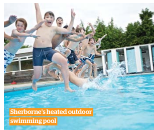
Sherborne's heated outdoor swimming pool