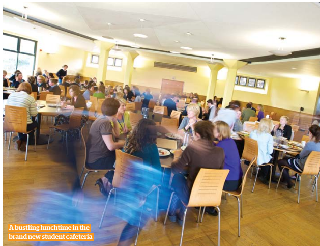
A bustling lunchtime in the brand new student cafeteria