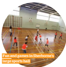
Fun and games in Sherborne's large sports hall