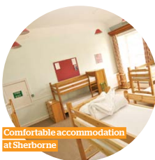
Comfortable accommodation at Sherborne