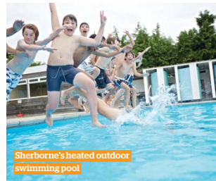
Sherborne's heated outdoor swimming pool