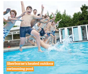
Sherborne's heated outdoor swimming pool