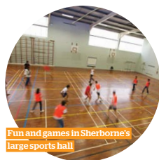
Fun and games in Sherborne's large sports hall