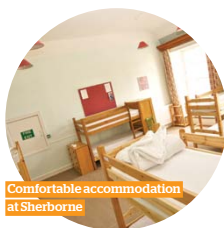
Comfortable accommodation at Sherborne