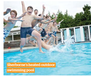
Sherborne's heated outdoor swimming pool