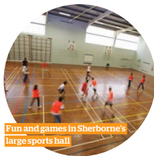
Fun and games in Sherborne's large sports hall