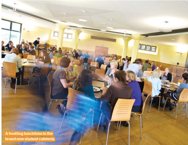
A bustling lunchtime in the brand new student cafeteria