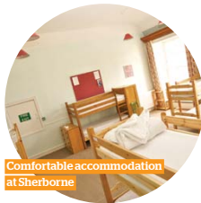
Comfortable accommodation at Sherborne