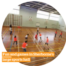
Fun and games in Sherborne's large sports hall