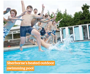
Sherborne's heated outdoor swimming pool