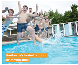
Sherborne's heated outdoor swimming pool