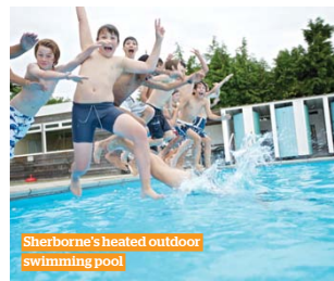
Sherborne's heated outdoor swimming pool