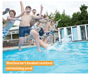
Sherborne's heated outdoor swimming pool