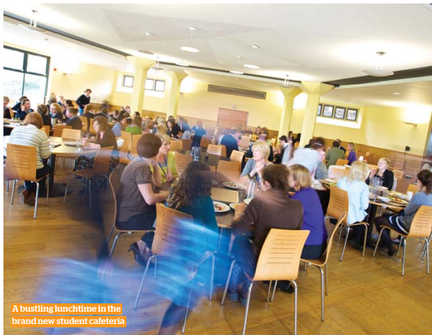
A bustling lunchtime in the brand new student cafeteria