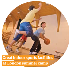
Great indoor sports facilities at London summer camp