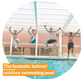
The fantastic indoor/outdoor swimming pool