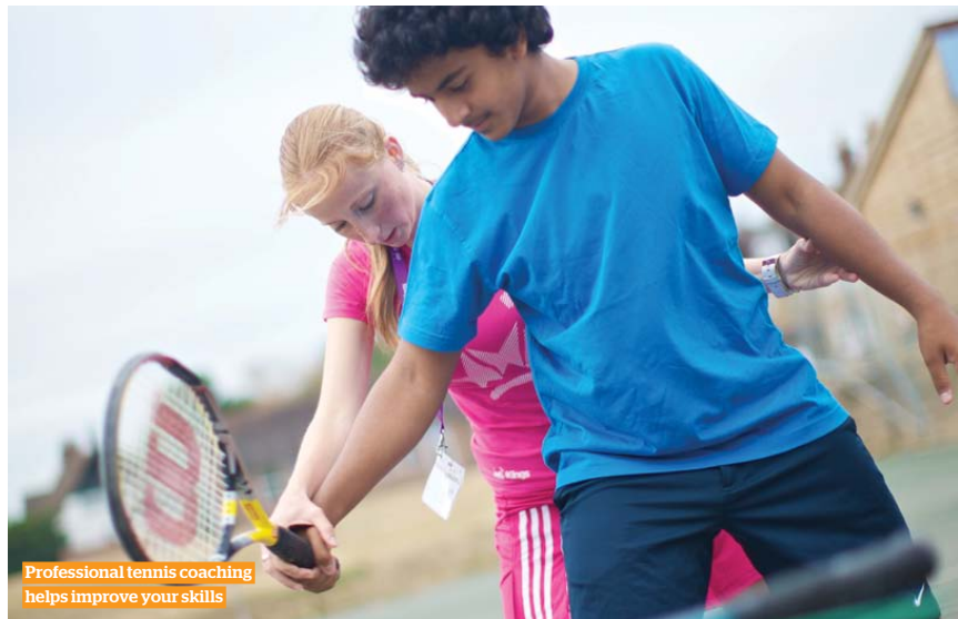
Professional tennis coaching helps improve your skills