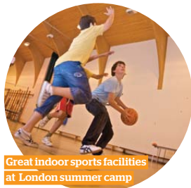
Great indoor sports facilities at London summer camp