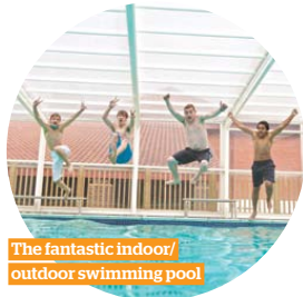
The fantastic indoor/outdoor swimming pool