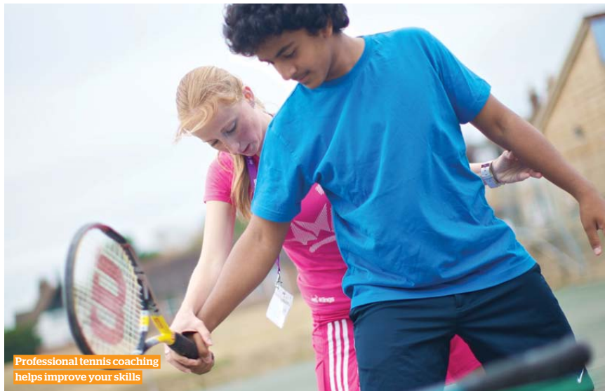
Professional tennis coaching helps improve your skills