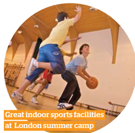
Great indoor sports facilities at London summer camp