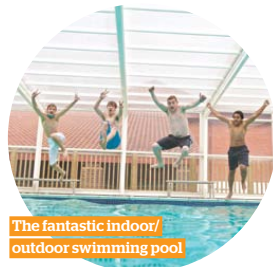
The fantastic indoor/outdoor swimming pool