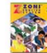
Zoni English System 2