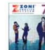
Zoni English System 7