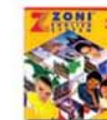
Zoni English System 3