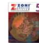
Zoni English System 5