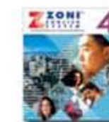
Zoni English System 4