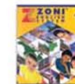
Zoni English System 1

The Zoni English System has been designed as a classroom instructional method in response to the demonstrated great needs of nonnative speakers of English in everyday life in English-speaking countries.