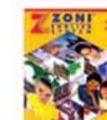
Zoni English System 3