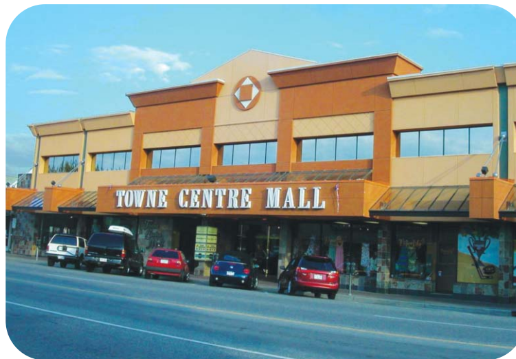
IGK Campus - 9 classrooms, lounge and free WiFi.

International Gateway Kelowna (IGK) is an English as a Second Language (ESL) institute located in Kelowna, Canada. Established in 2002, IGK is Kelowna's original and most trusted school. We are proudly Canadian owned and operated. International Gateway Kelowna is both a well respected school and a vibrant, friendly and exciting place to learn English. Students are encouraged to strive for excellence, immerse themselves in a new culture, enrich their minds, try new challenges and build bonds and memories that will last a lifetime. Highly qualified teachers and staff are carefully chosen for their professionalism, integrity and exceptional customer service skills. The upscale campus is centrally located in the downtown core within easy walking distance of attractions, shops, restaurants, beaches and transportation.