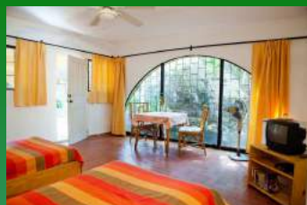
Studio at IIC Sosua