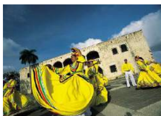
Folkloric Dance in Santo Domingo

You can sign up for Group courses (max. 7 students) or Private classes with 20 to 30 lessons per week. "Spanish PLUS" combines both course types. It is designed for those students who like to learn in groups, but also want to intensively work on their individual Spanish skills.