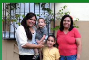
Homestay in Santo Domingo

2-star Standard apartment (category 2): centrally located in near-by apartment complex in the city center, 15 min walking to school and beach.