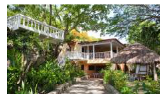
IIC Sosua on the north coast

Spanish & more: You like Latin music and dance? Then combine your Spanish course with dance lessons . Or take advantage of your unique surrounding and enjoy learning an exciting new sport like scuba diving, wind or kite surfing while studying at IIC. Also, don't miss the opportunity to get involved in different community programs with local NGOs through our program "Spanish & Volunteer Work" .