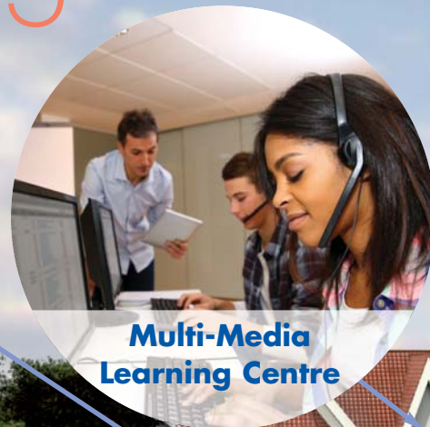
Multi-Media Learning Centre