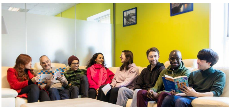
Great nationality mix