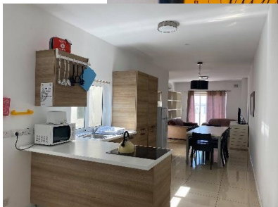
Sample One Week Programme