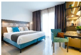
BAY VIEW HOTEL