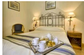
KENNEDY NOVA HOTEL