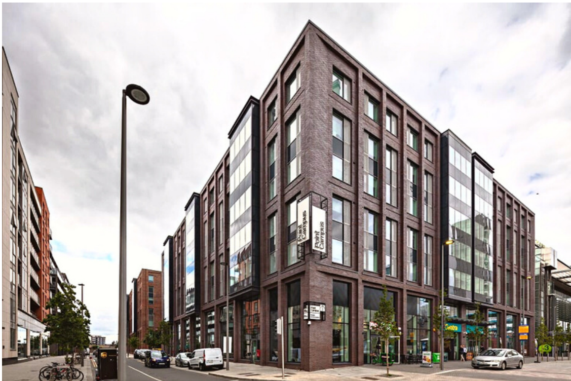
Host Point Campus, Point Village, Mayor Street Upper, Dublin 1, D01W2R1 - Location on Google Maps