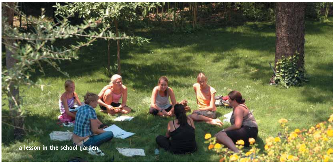
a lesson in the school garden

Book at worldwide lowest price at: https://www.languagecourse.net/el/sxoli-- +44-330 124 03 17 - support-el@languagecourse.net