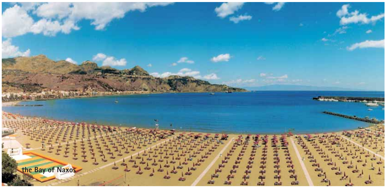
the Bay of Naxos

Book at worldwide lowest price at: https://www.languagecourse.net/el/sxoli-- +44-330 124 03 17 - support-el@languagecourse.net