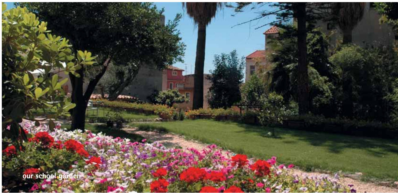
our school garden

Book at worldwide lowest price at: https://www.languagecourse.net/el/sxoli-- +44-330 124 03 17 - support-el@languagecourse.net