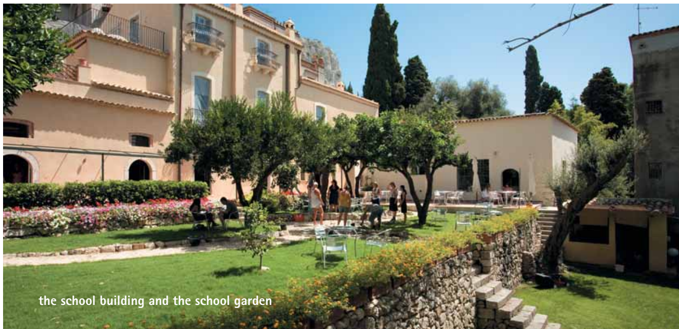
the school building and the school garden

Book at worldwide lowest price at: https://www.languagecourse.net/el/sxoli-- +44-330 124 03 17 - support-el@languagecourse.net