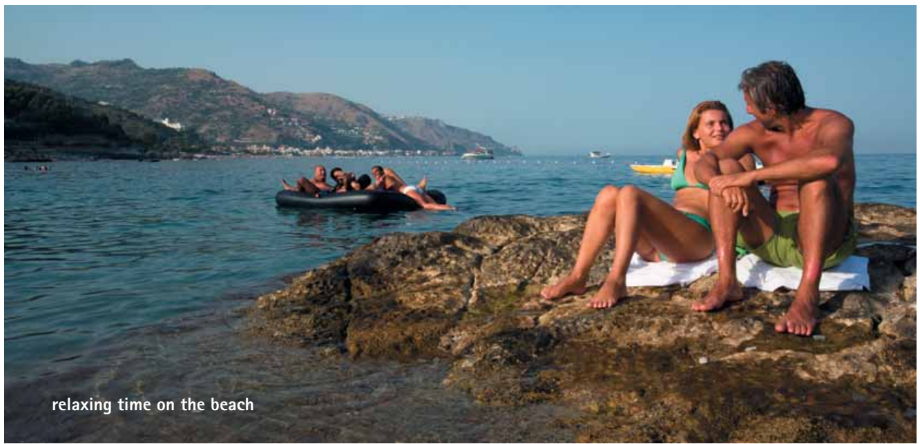
relaxing time on the beach

Book at worldwide lowest price at: https://www.languagecourse.net/el/sxoli-- +44-330 124 03 17 - support-el@languagecourse.net