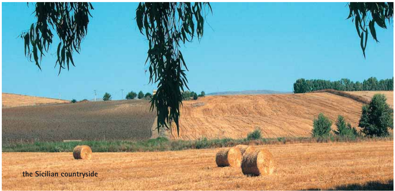
the Sicilian countryside

Book at worldwide lowest price at: https://www.languagecourse.net/el/sxoli-- +44-330 124 03 17 - support-el@languagecourse.net