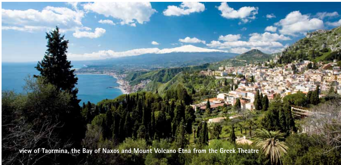
view of Taormina, the Bay of Naxos and Mount Volcano Etna from the Greek Theatre

Book at worldwide lowest price at: https://www.languagecourse.net/el/sxoli-- +44-330 124 03 17 - support-el@languagecourse.net