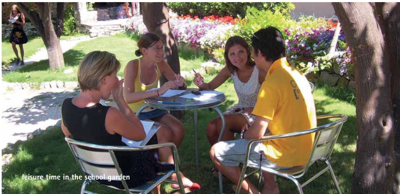
leisure time in the school garden

Book at worldwide lowest price at: https://www.languagecourse.net/el/sxoli-- +44-330 124 03 17 - support-el@languagecourse.net