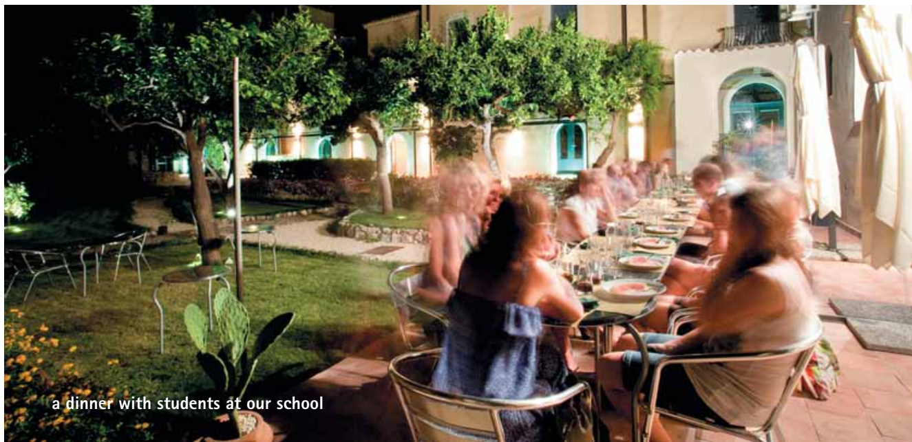
a dinner with students at our school

Book at worldwide lowest price at: https://www.languagecourse.net/el/sxoli-- +44-330 124 03 17 - support-el@languagecourse.net