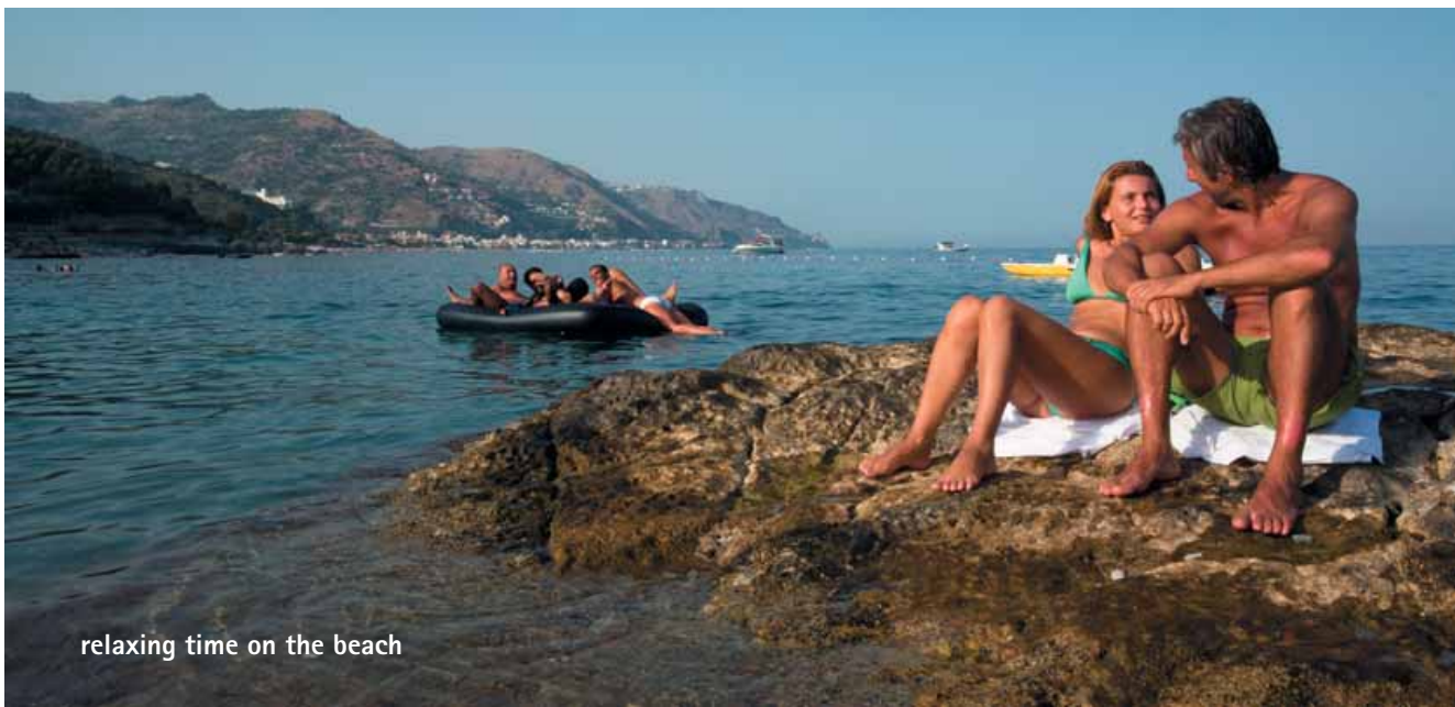
relaxing time on the beach

Book at worldwide lowest price at: https://www.languagecourse.net/ko/haggyo-- +44-330 124 03 17 - support-ko@languagecourse.net