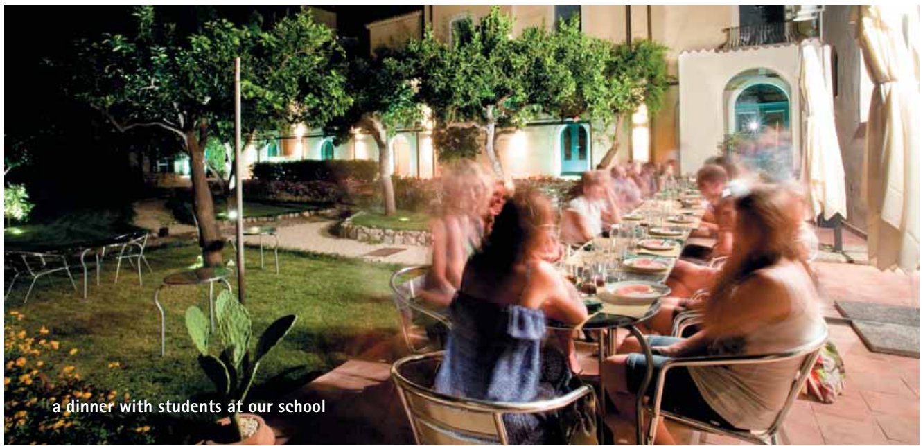
a dinner with students at our school

Book at worldwide lowest price at: https://www.languagecourse.net/ko/haggyo-- +44-330 124 03 17 - support-ko@languagecourse.net