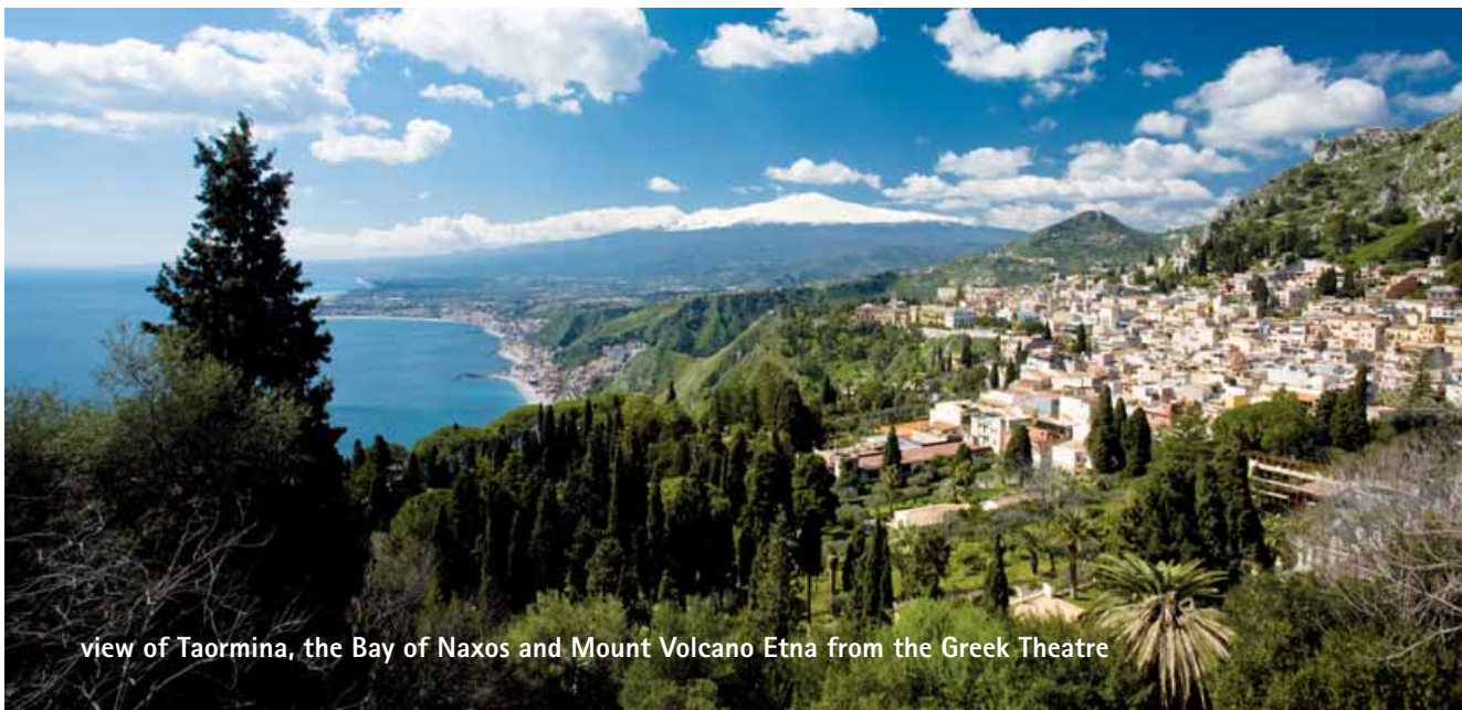
view of Taormina, the Bay of Naxos and Mount Volcano Etna from the Greek Theatre

Book at worldwide lowest price at: https://www.languagecourse.net/ko/haggyo-- +44-330 124 03 17 - support-ko@languagecourse.net