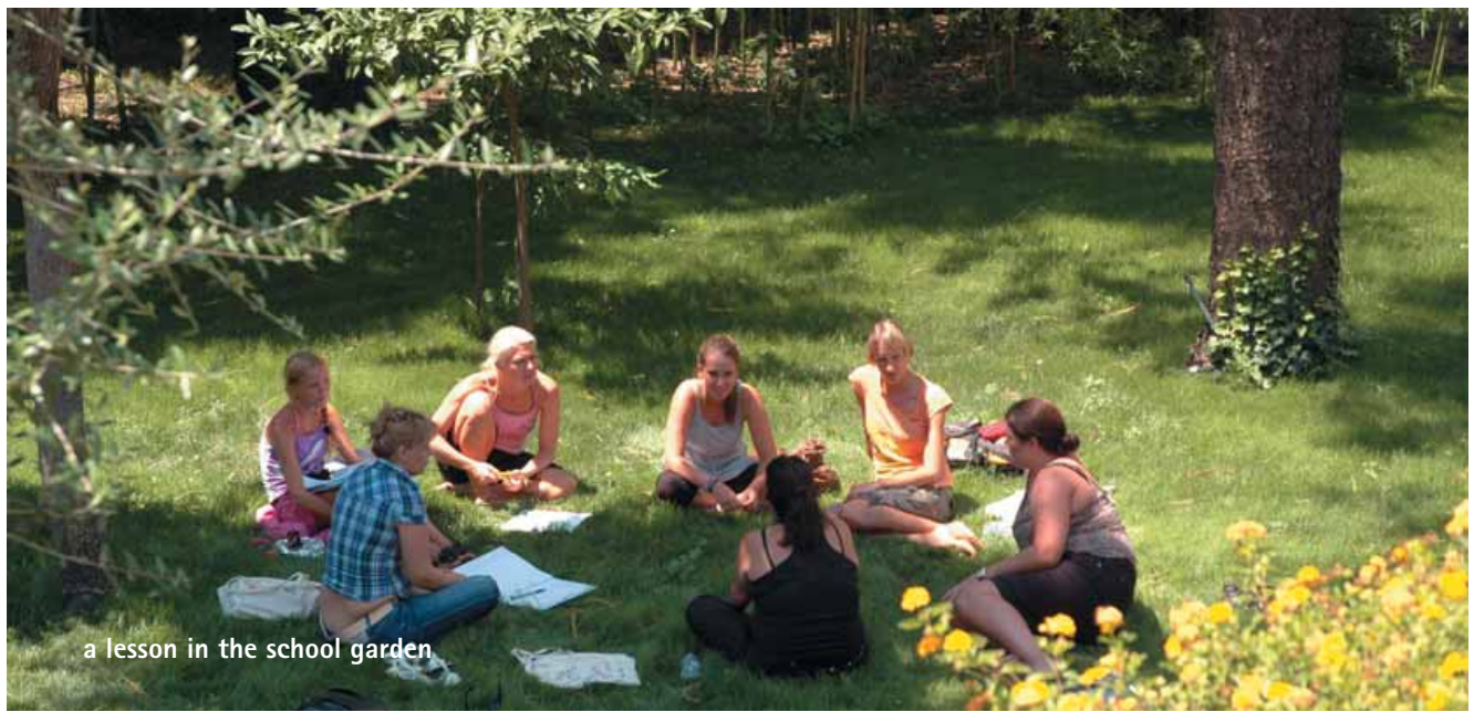
a lesson in the school garden

Book at worldwide lowest price at: https://www.languagecourse.net/ko/haggyo-- +44-330 124 03 17 - support-ko@languagecourse.net