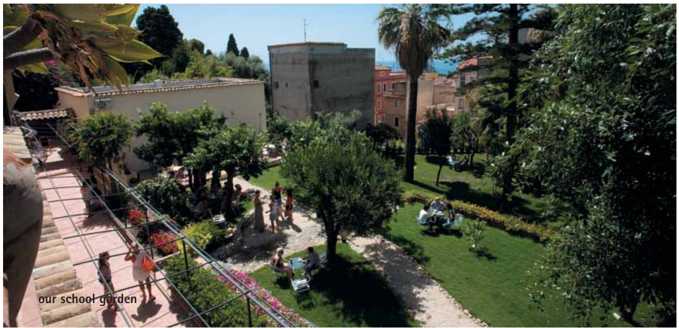
our school garden

Book at worldwide lowest price at: https://www.languagecourse.net/ko/haggyo-- +44-330 124 03 17 - support-ko@languagecourse.net