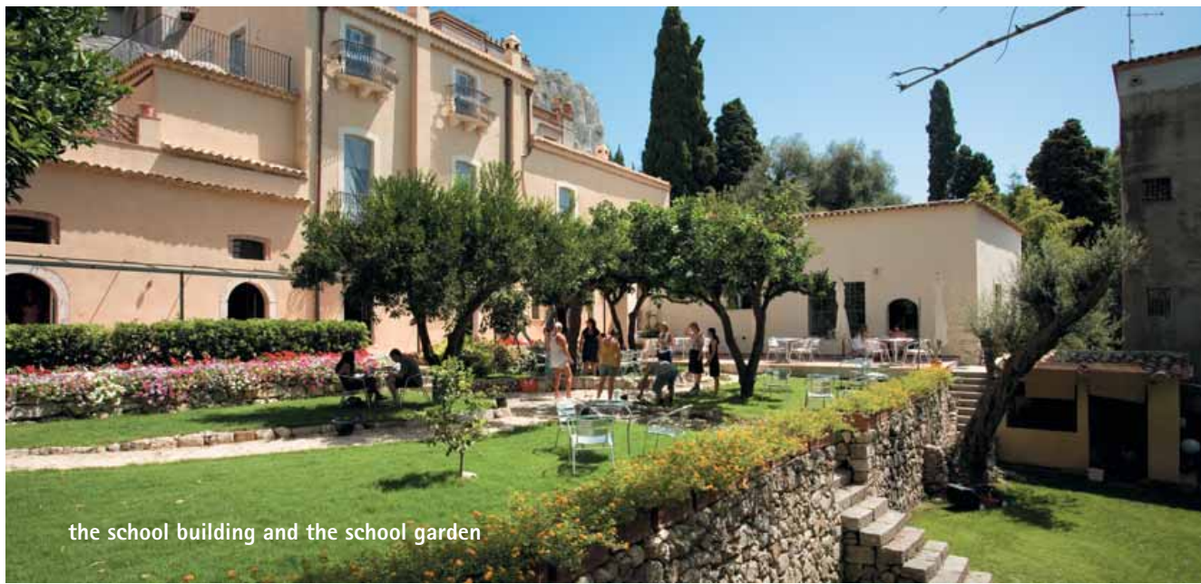
the school building and the school garden

Book at worldwide lowest price at: https://www.languagecourse.net/ko/haggyo- +44-330 124 03 17 - support-ko@languagecourse.net