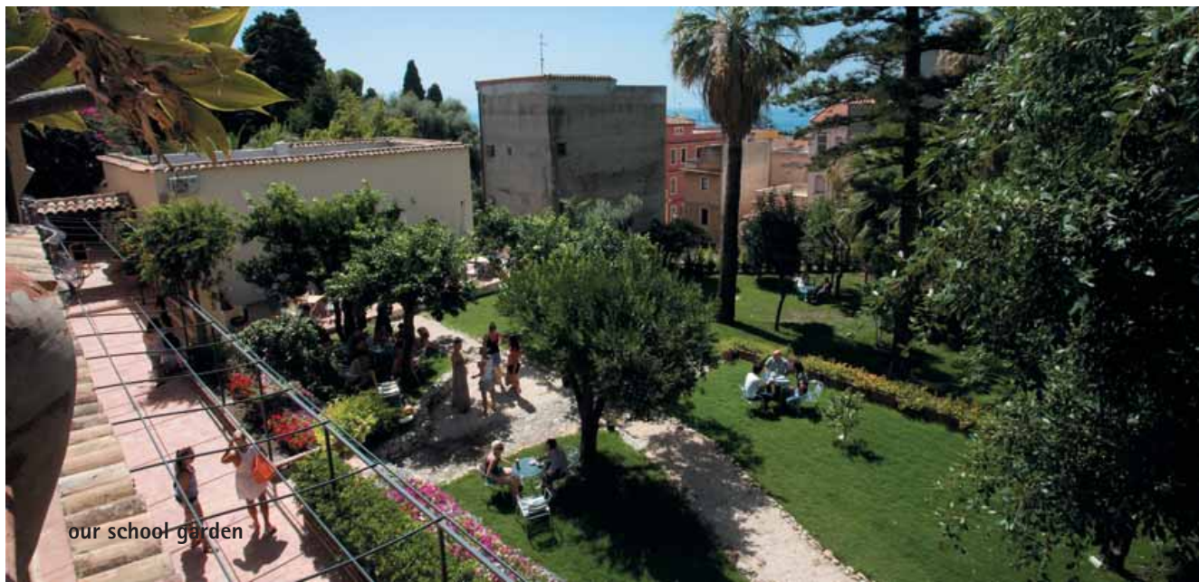
our school garden

Book at worldwide lowest price at: https://www.languagecourse.net/zh/school-- +44-330 124 03 17 - support-zh@languagecourse.net