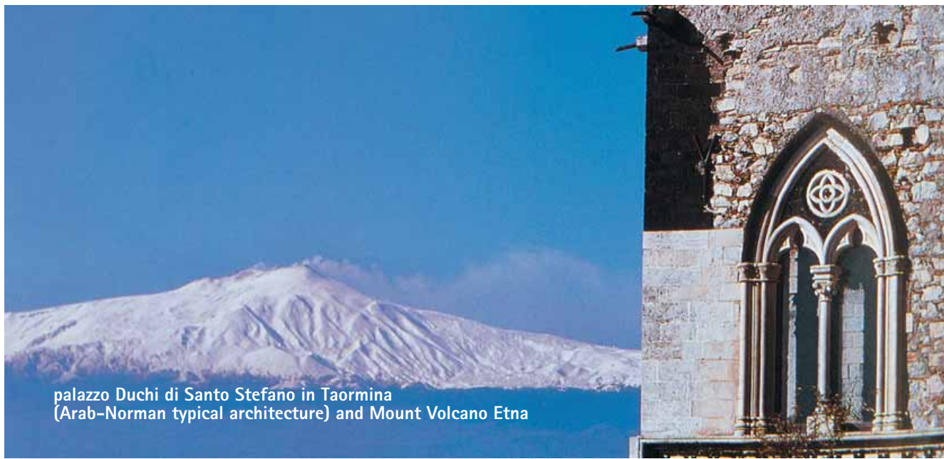
palazzo Duchi di Santo Stefano in Taormina (Arab-Norman typical architecture) and Mount Volcano Etna

Foglaljon a legalacsonyabb áron: https://www.languagecourse.net/hu/iskola-- +44-330 124 03 17 - support-hu@languagecourse.net